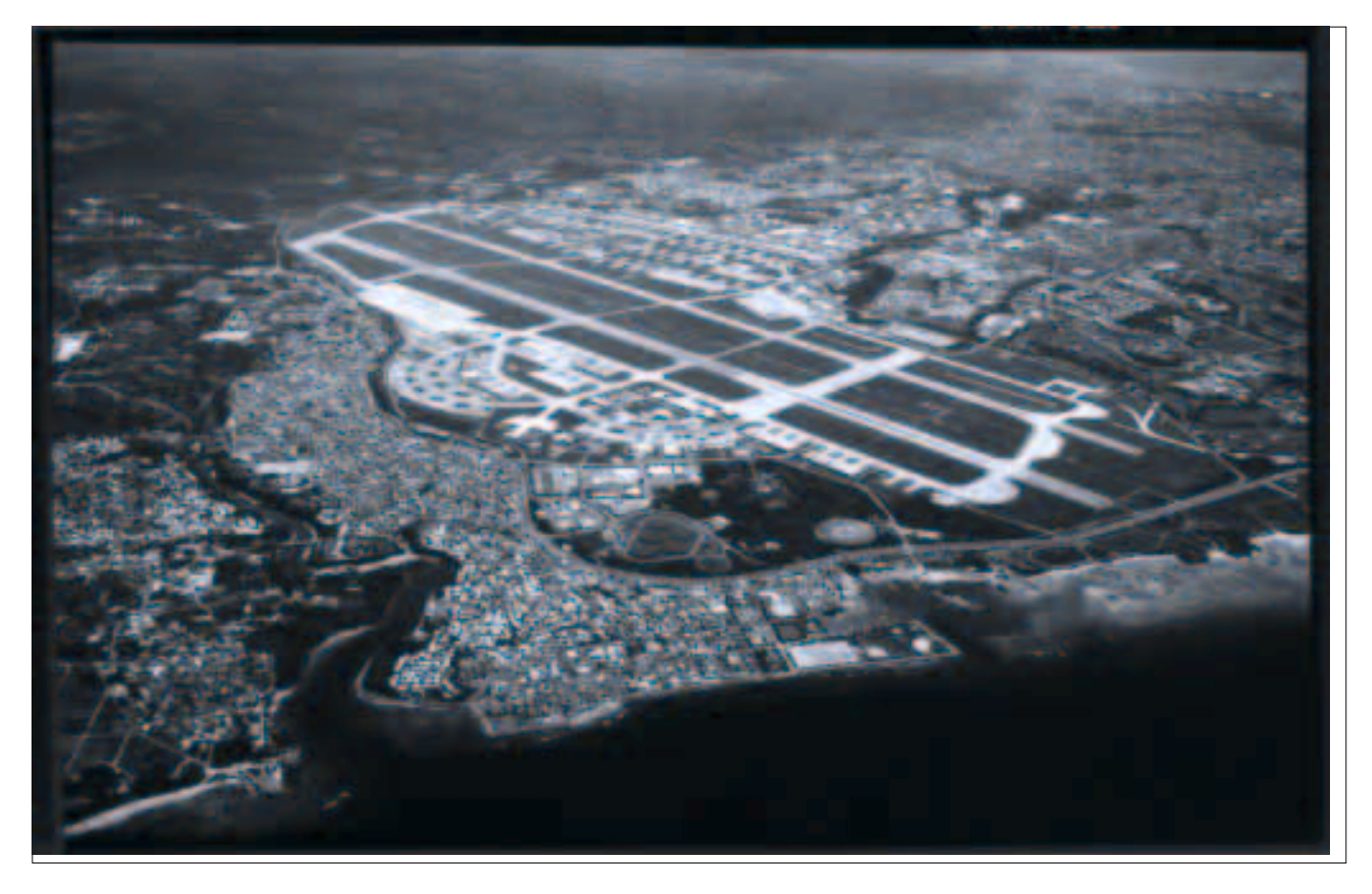
Kadena Air Base is in a densely populated area.

around and hit the girl. She was dead by the time she arrived at a hospital.