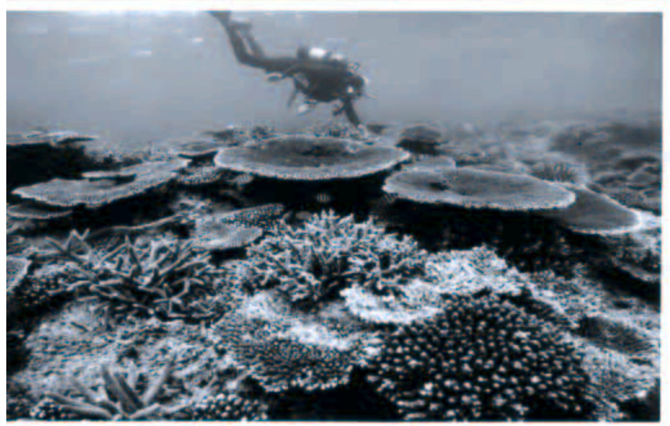
Coral reef off Henoko. The area is a possible site for a planned U.S. base.

life with a 200 year fatigue life." The U.S. plans to construct a military base that can be used well into the 21st century.