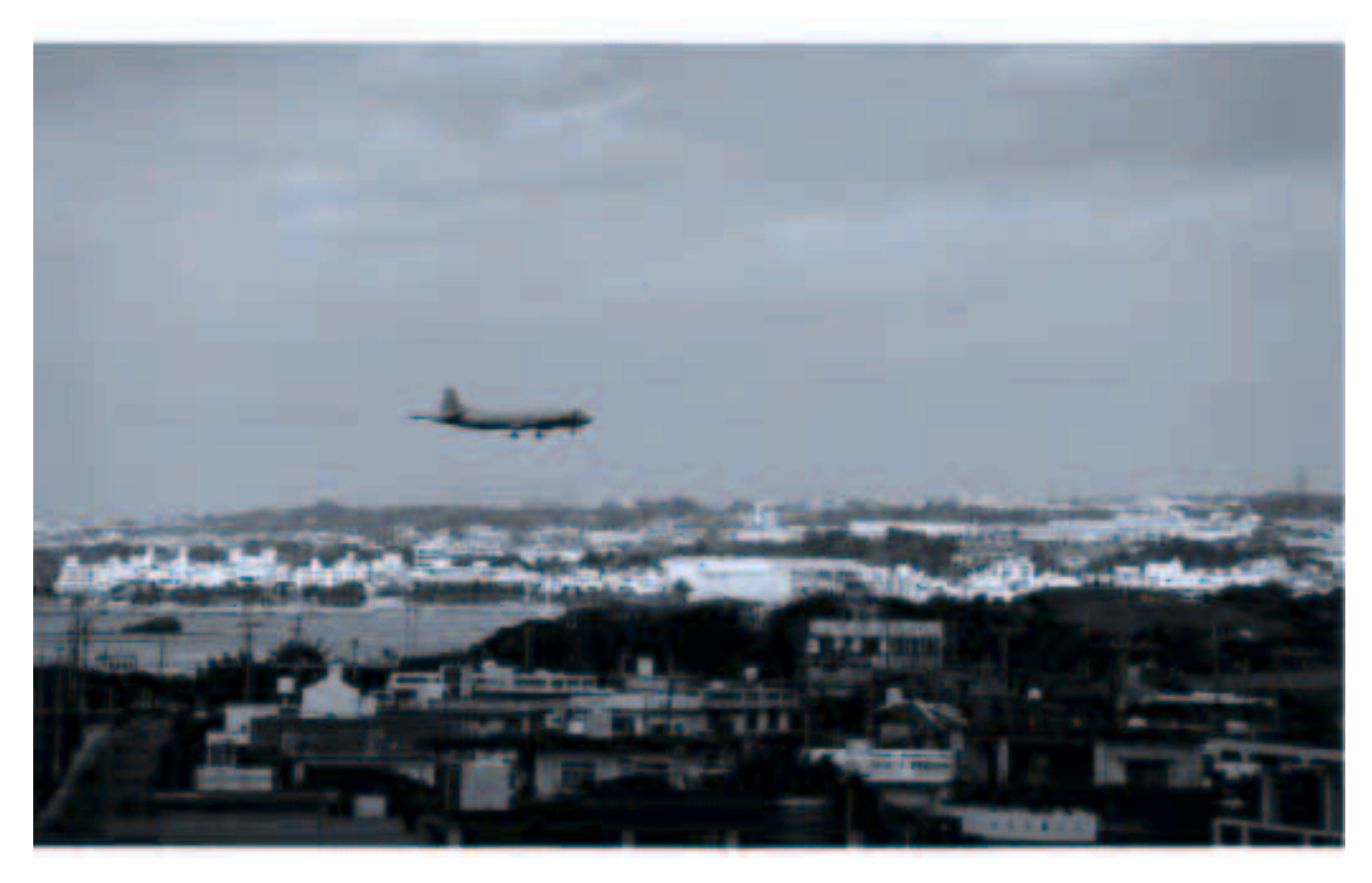
Military plane taking off from Kadena

by the killing of a mother and her two children in a car accident and the hit-and-run case of a high school girl.