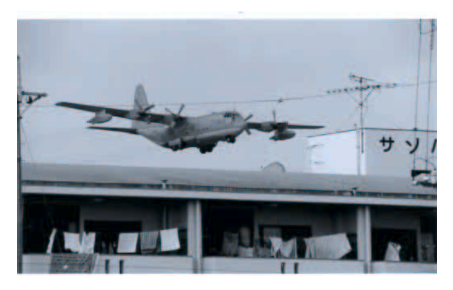
The Okinawan people are disturbed by noises from U.S. military aircraft. (Ginowan City)

impact of aircraft noises on the health of residents. The sampling was the most extensive ever taken in this kind of scientific research. The medical as well as scientific research established such noise effects as increasing behavioral aberration among infants, low-weight births, and impaired hearing. It is safe to conclude that these problems are closely related to the fact that U.S. bases are located in densely populated areas in Okinawa.