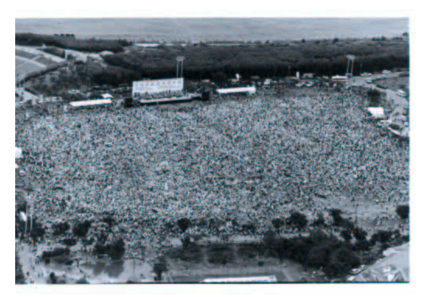
"Give us back a quiet and peaceful Okinawa." Over 85,000 people rallied on October 21, 1995, protesting the rape of a school girl by U.S. soldiers.